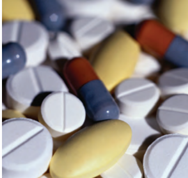
Specialty Gas Filtration