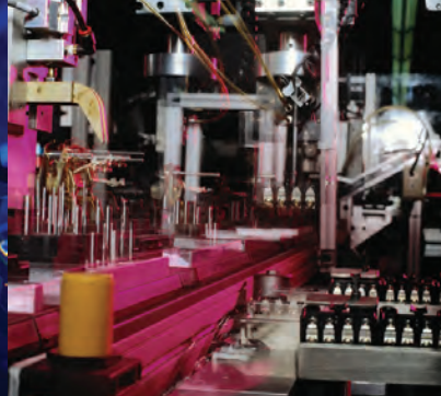
Process Gas Filtration