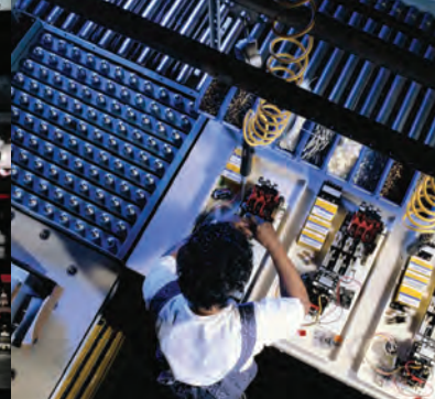
Critical Blow Off Applications