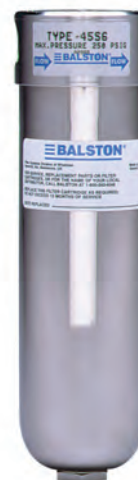
Models 33S6 and 45S6

All-stainless steel with 1/2" NPT inlet and outlet ports. Both filters are also available with clear Pyrex® glass bowl (100 psig rating) with breakage-protection external plastic shield.