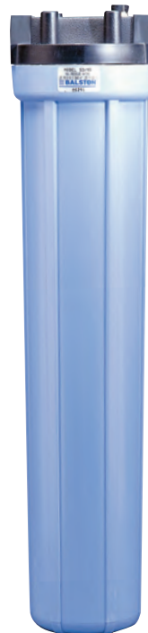
Models 53/18, 53/50, and 53/95 (shown)