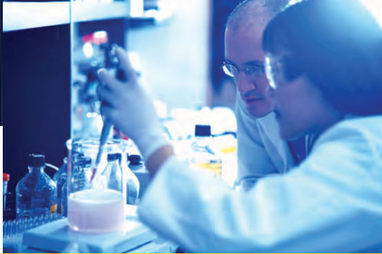
Clean In Place (CIP) Steam Filtration