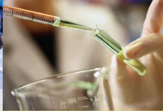
Steam Filtration to Sterilizers and Autoclaves